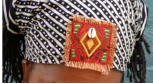
Custom Embroidered Detail

Bandana / Headband, with embroidered motifs